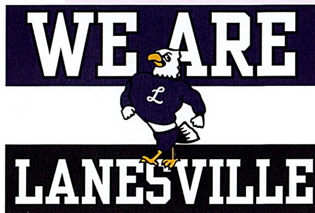
Sign Option #2 - $25