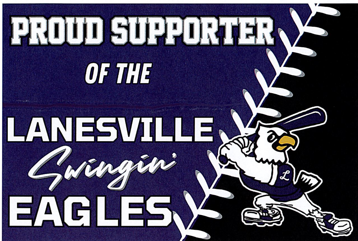
Eagle Yard Sign Design Options