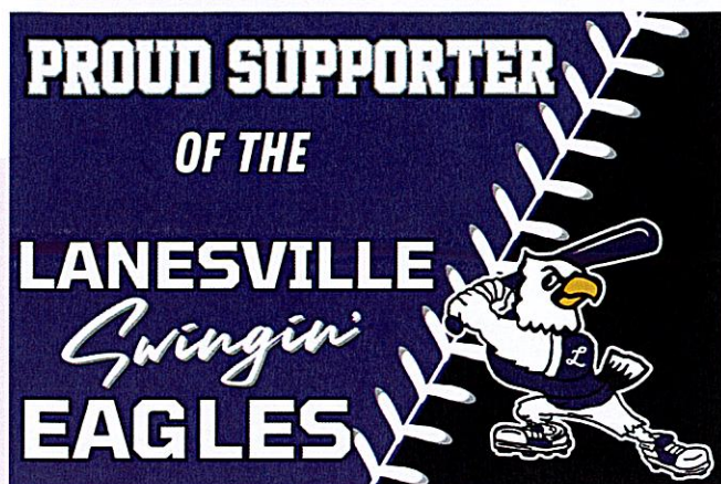
Sign Option #1 - $25

Benefiting the Lanesville High School Baseball Booster Club